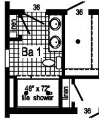
Optional 4' x 6' Walk-In Tile Shower